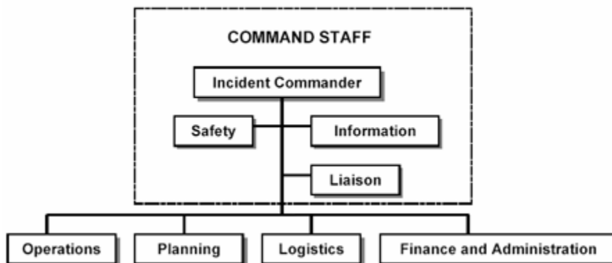
Figure 1 — Incident Command System Structure